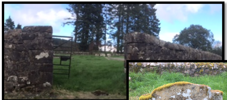
Left - the battle of Falkirk re-run! Right and above - Kirk o' Muir graveyard